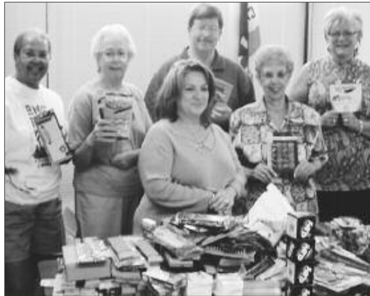
Sacramento Chapter provides school supplies.

The Sacramento chapter also held a barbeque dinner on August 23, 2006 and the entrance fee was school donations. We had a good turnout with over 30 people attending and we received an overwhelming amount of