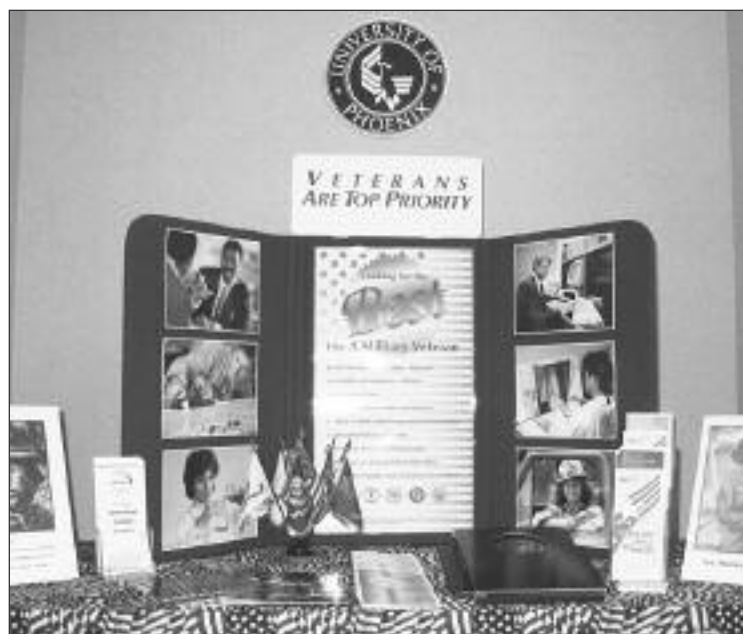
Display developed by Employment Development Department, Yolo County Department of Employment and Social Services and the University of Phoenix.