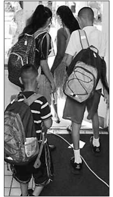
Kids appreciate backpacks filled with school supplies from the Fresno Chapter.

families were not the only ones to benefit from this year's event, local members also benefited by knowing that they made a difference to help someone else smile.