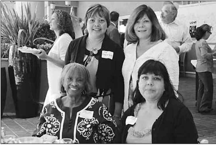
Members of the Los Compadres Chapter at the Light the Night Walk Kickoff Luncheon.