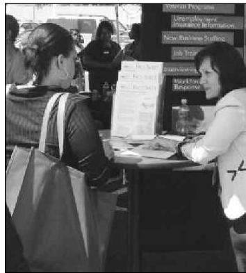
EDD staff members assisting customers at the Fair