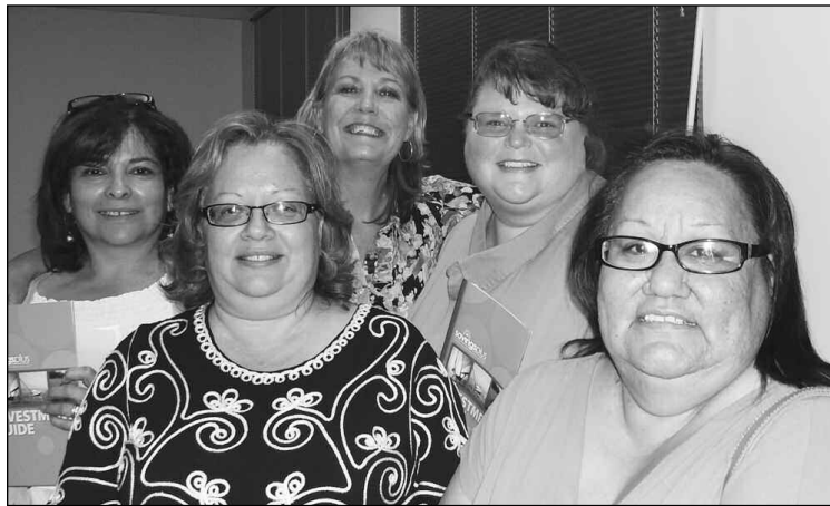
Inland Empire members at the Money Management Workshop.

The Inland Empire Sub Chapter has formed a walking team that will meet once a month to walk a popular local walking trail. During each walking session the team will focus on the healthy aspects of walking and will learn techniques to improve their walking