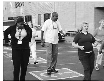
Members line dance at the Last Great BBQ.