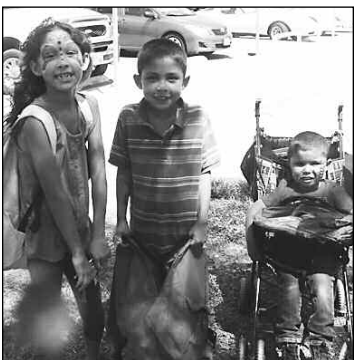
Students receive backpacks from the Annual Back to School Health Fair.

Since 2005 our team has contributed over $7,500 to LLS. This year's goal is $2,000 so we need your support! We will be hosting fundraisers including luncheons, LLS Balloon Sales and gift basket drawings at our local offices. Please consider starting your own team and raising funds for this worthy cause or join our team on October 22, 2011, at Warner Center Park in Woodland Hills. If you would like to make a donation please visit our team page at: http://pages.lightthenight.org/los/WarnerPk11/LosCompadresIAWP .