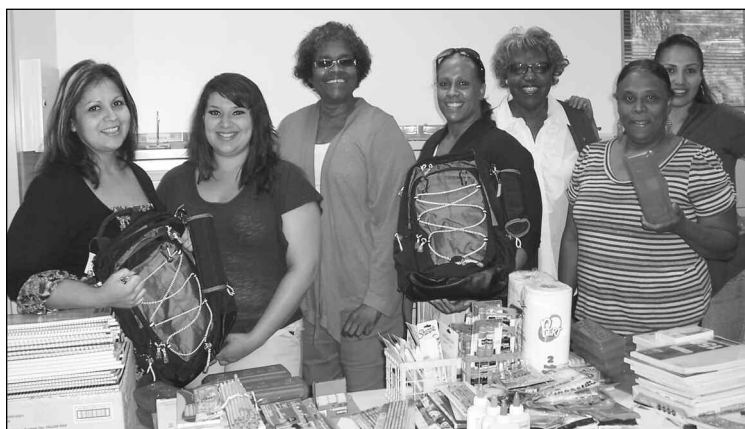
Inland Empire members display school supplies donated for backpacks in 2011.