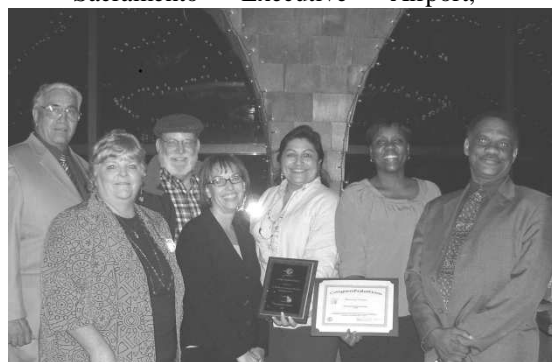
IAWP Award winning Members